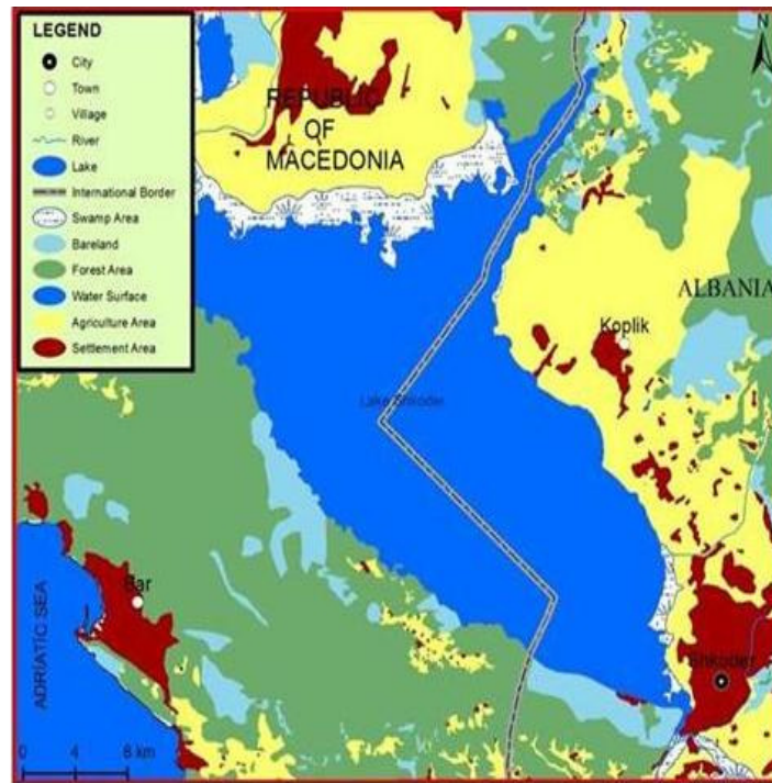
Figure 3. Lake Shkoder's general landuse map