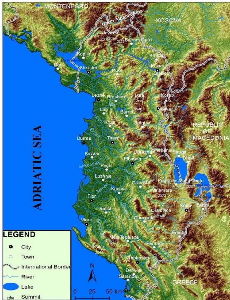
Figure 1. Topographic map of Albania.

Albania is counted as one of the important fresh water reserves in Europe. Drini, Semani, Vjosa, Shukumbini, Mati and Erzeni are the rivers that have an irregular and mixed regime (snow-rain) due to its having the features of the Mediterranean climate. Apart from these there are a lot of small brooks that take their sources from the high hilly blocks in the east. Besides there are a lot of natural lakes. Some of them are Lake Shkoder (368 km 2 ), Lake Ohrid (362 km 2 ), Lake Prespa (285 km 2 ) and Lake Butrinti (16 km 2 ).